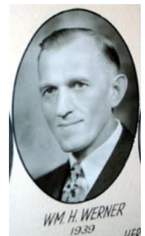
Upholsterer, Purchasing Agent Kroehler Mfg. Co.